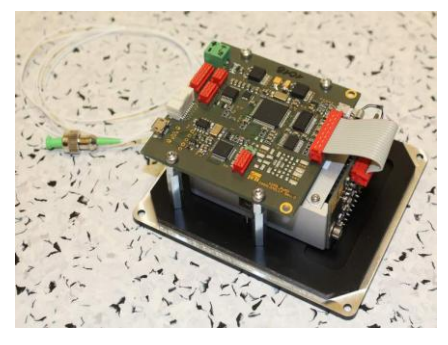
I-MON OEM Developer's Kit

The spectrum graph screen of the Evaluation Software illustrates the pixel response from the image sensor of the I-MON 256/512 OEM, i.e., the FBG sensor peaks.